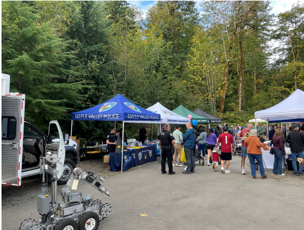
Annual Maple Valley Community Emergency Preparedness Fair